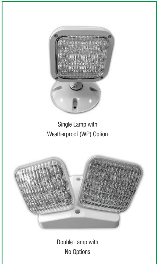
Single Lamp with Weatherproof (WP) Option

U.L. listed and meets or exceeds the following: U.L. 924, N.E.C. requirements and N.F.P.A. 101.