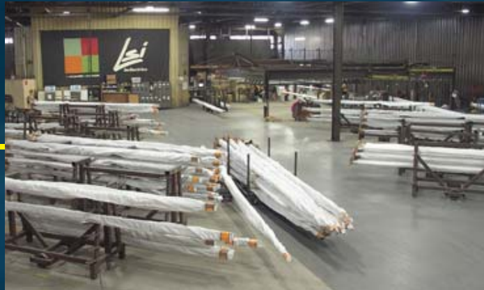
▲ LSI Pole Inventory Area - Poles finished and ready to ship

DuraGrip Plus is our top-of-the-line pole finish. In addition to our standard DuraGrip exterior polyester-powder coated finish, an inner-coating of a water-based automotive-grade corrosion preventative is applied. This coating seals the bottom portion of the pole to protect against moisture and atmospheric corrosive matter. DuraGrip Plus is warranted for seven years.