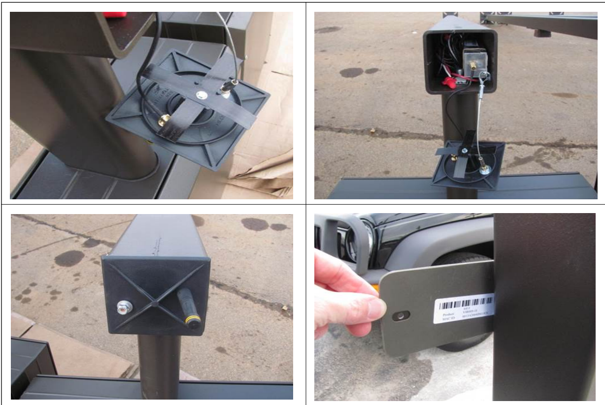
Figure 2: Controller Mounting

Note: Make sure that the coax cable is not supporting the weight of the controller.